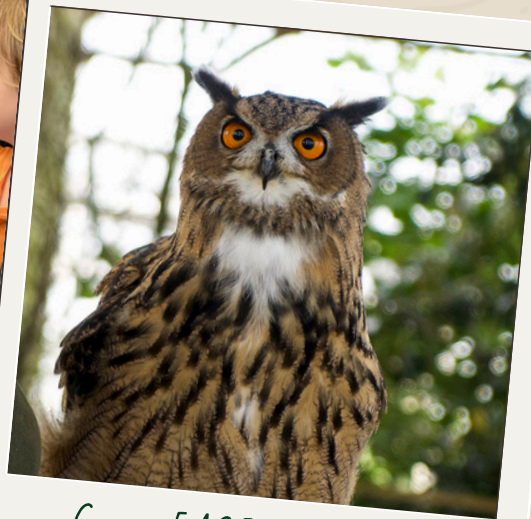
Come FACE-TO-FACE with wildlife...