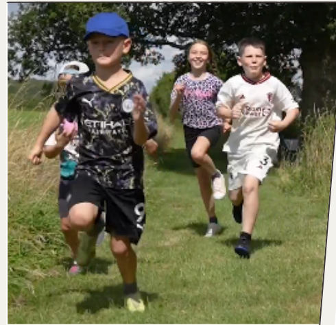
Freedom to EXPLORE ...