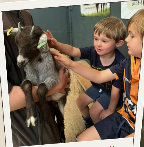
Get HANDS-ON with our rare breeds...