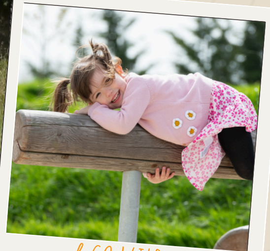
and GO WILD in our adventure play areas...

EXPERIENCE THE BEST OF THE BUCKINGHAMSHIRE COUNTRYSIDE WITH ALL-WEATHER BIRTHDAY FUN!