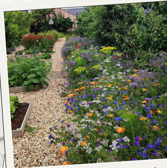
EXPLORE our nature trails and walled veg garden...