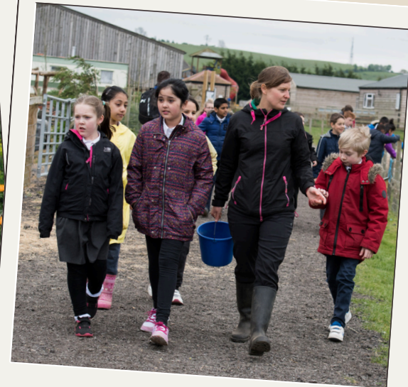
and CONNECT with the great outdoors...