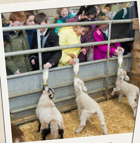
Get HANDS-ON with our rare breeds...