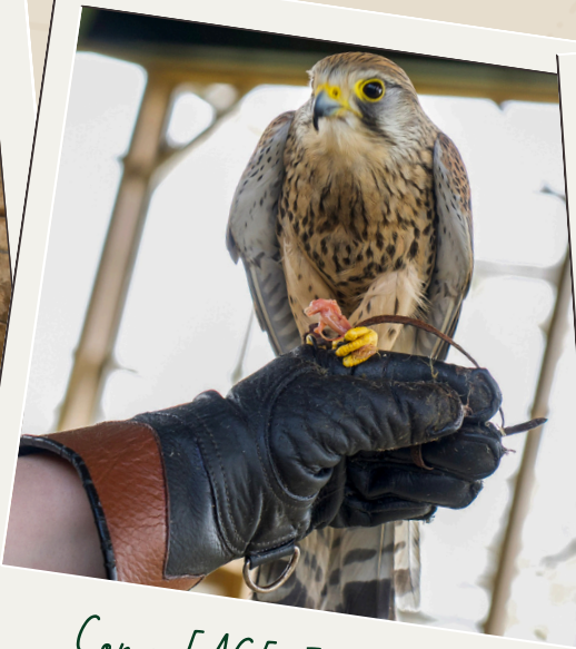
Come FACE-TO-FACE with wildlife...